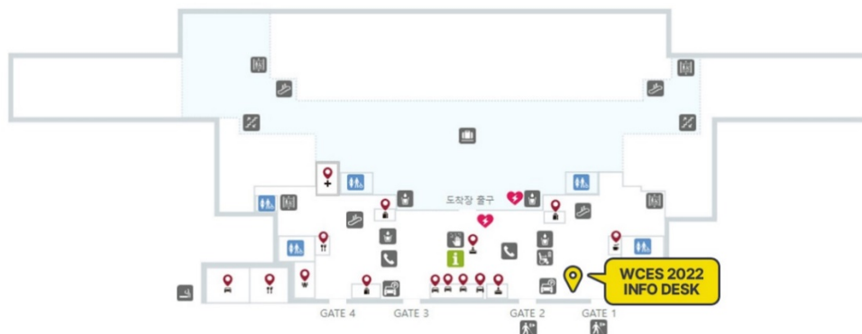
Gimhae Airport ( left side of Gate 1 , in front of Shinhan Bank)